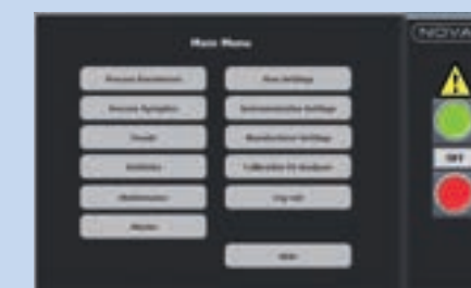
HMI Siemens® SIMATIC touchscreen series with color touch screen