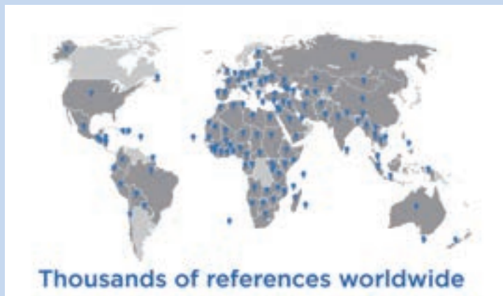
Thousands of references worldwide

Our deeply dedicated team manufactures superior equipment that is engineered and tested under the most rigorous standards, so that no challenge is ever too ambitious when it comes to meeting the needs of our customers.